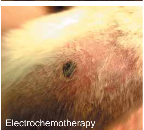
Figure 2. Example of good antitumour effectiveness of electrochemotherapy with cisplatin on SA-1 tumours. Cisplatin was given intravenously (4 mg/kg), 3 min thereafter 8 electric pulses were applied to the tumour with plate electrodes. Electric pulses were applied in two directions; 4 pulses in one and the other 4 in the perpendicular direction. Eight days after the treatment, good antitumour effectiveness of electrochemotherapy with cisplatin is evident, compared to the treatments with cisplatin or electric pulses alone.