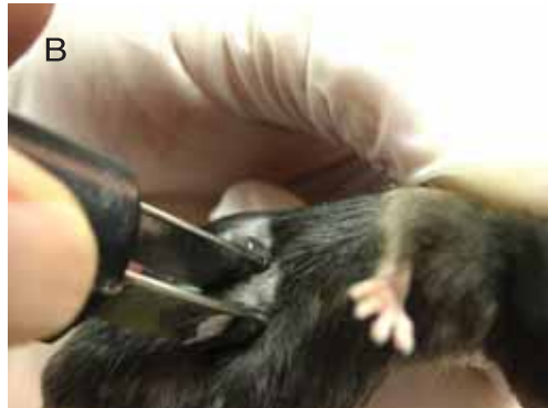
Figure 1. Protocol of electrochemotherapy of experimental tumours presented schematically (A). The drug is injected either intravenously or intratumorally, at the doses that do not exert antitumour effect. After the interval that allows sufficient drug accumulation in the tumours, electric pulses are applied to the tumour either by plate or needle electrodes (1300 V/cm, 100~\mu s , 1~Hz or 5~kHz, 8~pulses). The plate electrodes are placed in that way that the whole tumour is encompassed between the electrodes, providing good electric field distribution in the tumours for an optimal electroporation of the cells in the tumours (B).